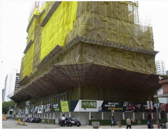
深水埗項目 Sham Shui Po Projects