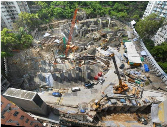
丹拿山項目 Tanner Hill Project

The next few years will be the peak of HKHS's construction works. HKHS is committed to monitor and ensure contractors' safety measures on site.