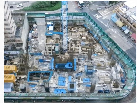
筲箕灣道項目 Shau Kei Wan Project