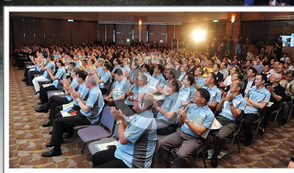
研討會花絮 Conference Highlight