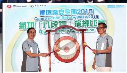
開幕典禮暨氣功「八段錦」比賽花絮 Kick-off Ceremony cum Qigong Display Competition Highlight