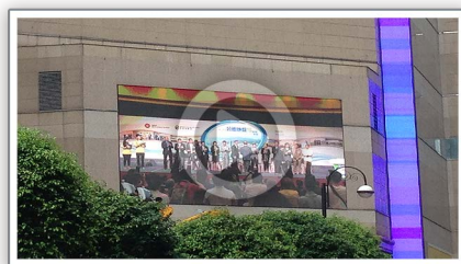
前期宣傳片 Pre-event Video