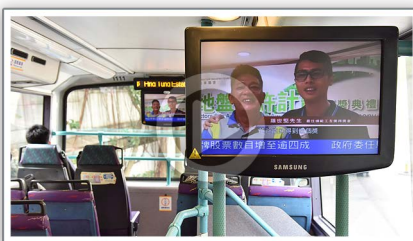
後期宣傳影片 Post-event Video