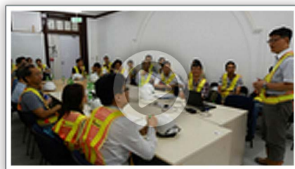
工地參觀花絮 Site Visit Highlight